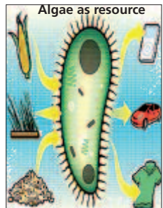
Algae as resource