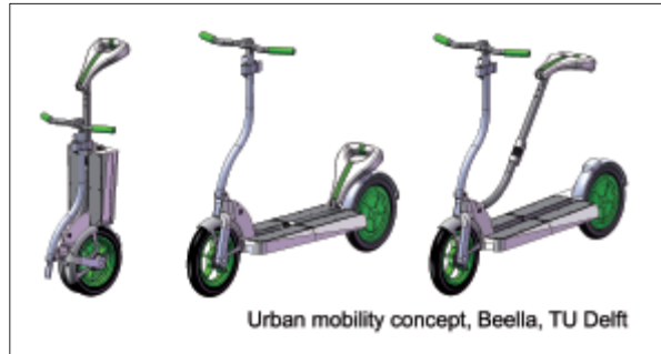
Urban mobility concept, Beella, TU Delft